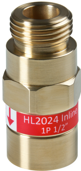
Top left: HL2024 Inline 1P 1/2" m-f