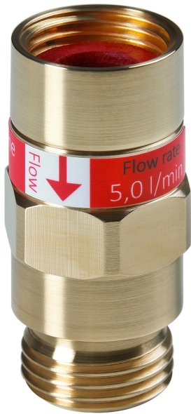
Top left: HL2024 Inline 1P 1/2" f-m