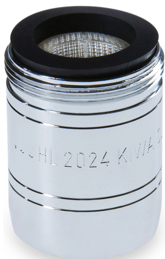
Top left: HL2024 Tap M24