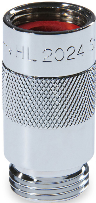
Top left: HL2024 Shower